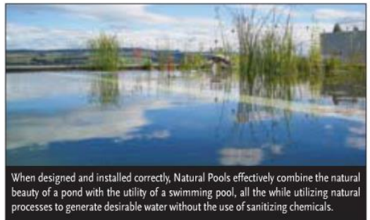
When designed and installed correctly, Natural Pools effectively combine the natural beauty of a pond with the utility of a swimming pool, all the while utilizing natural processes to generate desirable water without the use of sanitizing chemicals.