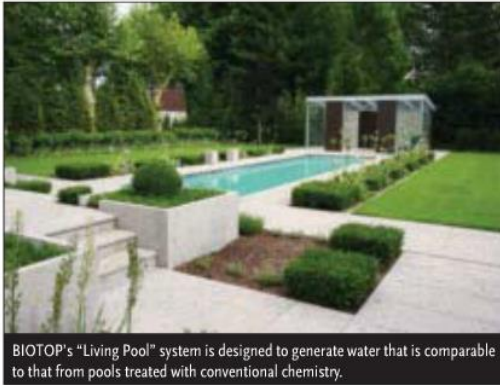
BIOTOP's "Living Pool" system is designed to generate water that is comparable to that from pools treated with conventional chemistry.